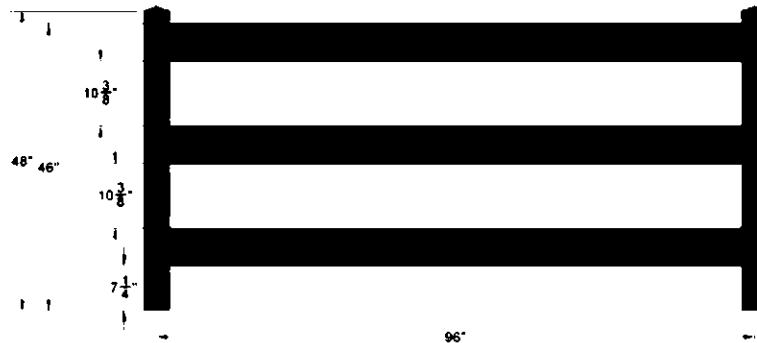
Exhibit B: Three Rail Black Steel Fence required for Lots that allow horses.