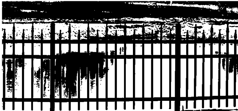
Exhibit A: Wrought Iron Fence, Pattern and Color required for all Fencing in Eagle Ridge.

Section 3.18. Fences. No fence, wall or hedge shall be erected, placed or altered on any Lot without the prior written approval of the Architectural Control Committee, and the design of and materials used in the construction of fences shall be subject to the prior written approval of the Architectural Control Committee. Design of fences and materials used in the construction of fences shall be in compliance with the Town's zoning ordinance. Fences must be black wrought iron (to match fence along perimeter of property along FM 407). See, Exhibit A below. Fencing for Lots that allow horses must be three-rail black steel fence. See, Exhibit B below. Each corner of the fence must be made of a stone column that matches the home or the other stone in the development (grey lueder stone to match monument sign and developer screening wall along FM 407). All fencing requires prior written approval by the Architectural Control Committee.